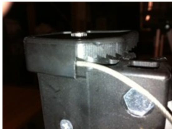
Complete Corner attachment

Find the wire L shaped corner under the adjustable corner cap. Now slide corner cap to closed position to snug up the wire securely on all four legs.